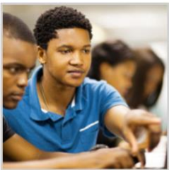
Education is Key