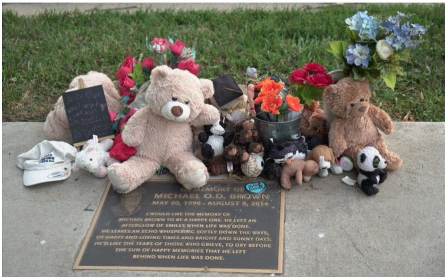
Memorial of Michael Brown (Ferguson, MO)