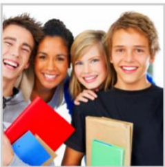
Peers Helping Peers