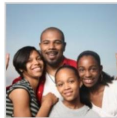
Healthy Family Life